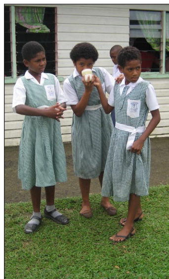
Children at St Joseph The Worker's School

We started our trip in Fiji disappointed that we were not able to go out and find great mission stories to bring back to the parishioners of the Arlington Diocese. We